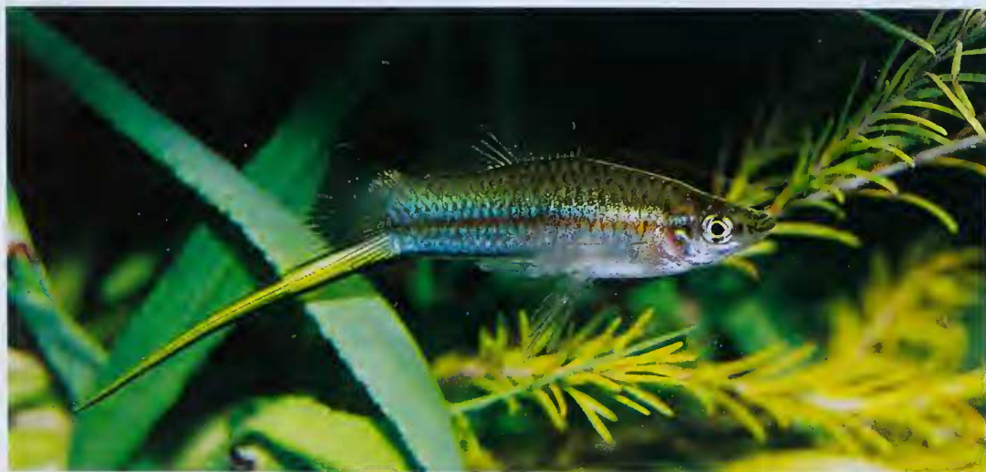
Figure 1 Male green swordtail Xiphophorus helleri , 55 mm TL.

highlights the need for more stringent regulations regarding the importation of exotic species for the aquarium industry.